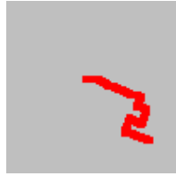
Fig. 3. Screen shots of the stick visualization of a hidden melody that we have used. The closest melody from the melody population in figure 2 would be chosen to play every cycle time.